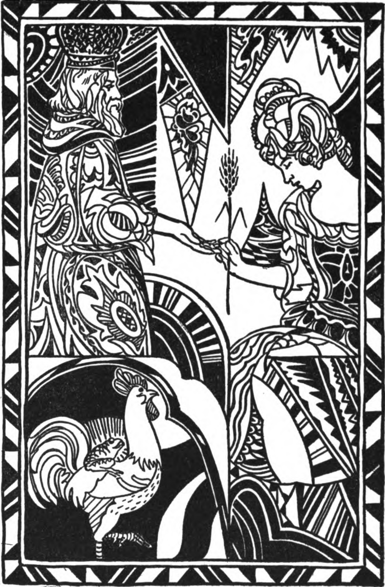
This, the Bride of the Youngest Prince, Is My Choice